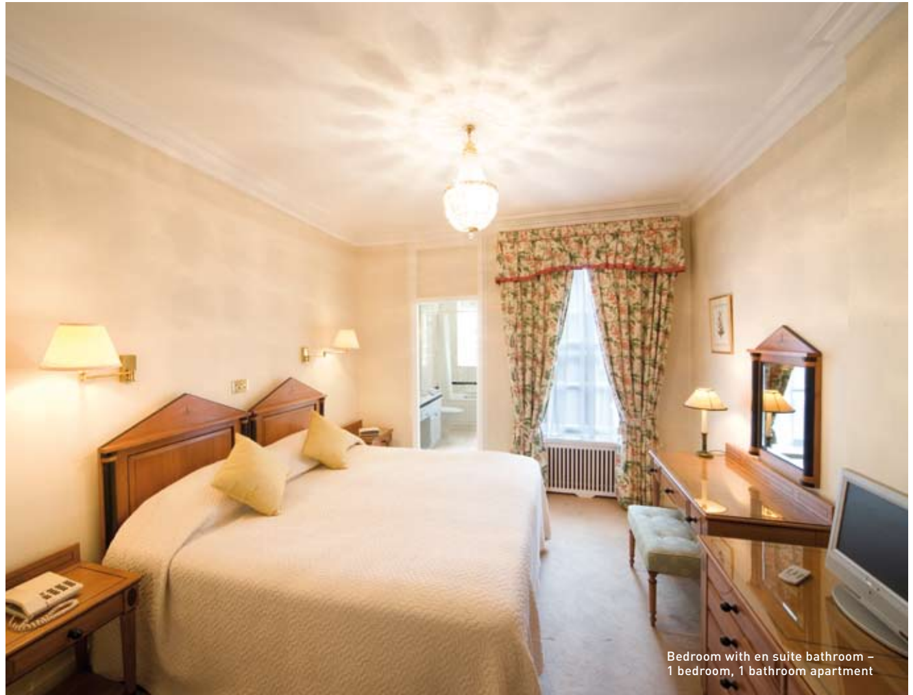
Bedroom with en suite bathroom – 1 bedroom, 1 bathroom apartment

We have two further properties close by, providing a greater selection of apartments to choose from.