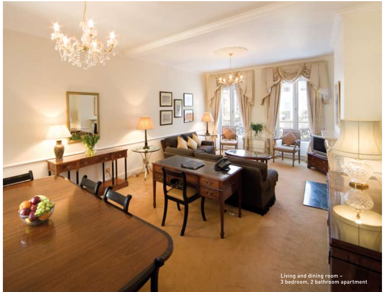
Living and dining room – 3 bedroom, 2 bathroom apartment