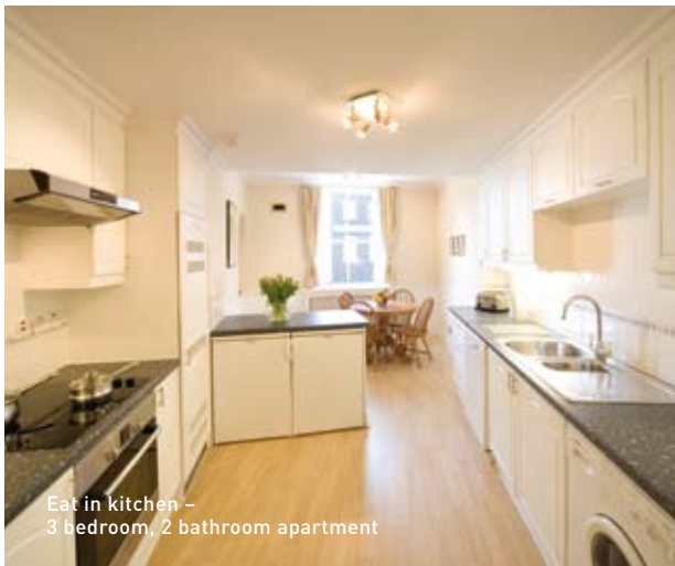
Eat in kitchen – 3 bedroom, 2 bathroom apartment

Our three bedroom apartments are in a distinguished location and are ideal for those who enjoy extra space.