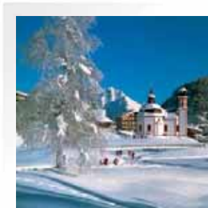
Silent Night Chapel