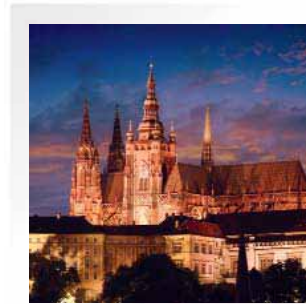
Prague at night

Day 5, Mon. NUREMBERG - CONTINENTAL DIVIDE - RIEDENBURG. Enjoy a guided morning tour of this historic city with its fabulous Gothic churches and elegant patrician houses. See the storybook 900-year-old ramparts that surround the city, the Imperial Castle and the Justice Palace where the War Crimes Tribunal sat in 1946. After your tour, visit the world's largest Christmas Market, where over 100 red and white canvas-topped booths offer an assortment of unique children's toys, tinsel angels, dolls, dollhouses, gingerbread and the list goes on. At lunchtime rejoin the ship further along the Main-Danube Canal and continue to the highest point of your cruise - 1,332 feet above sea level - before descending through stair-step locks to stop in the Bavarian town of Riedenburg. (B,L,D)