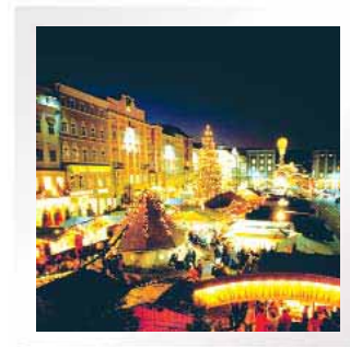
Christmas Market, Linz

Celebrate the magic of the wonderful winter season with a fascinating trip from historic Prague through the beauty and history of the Danube, Europe's second largest river. Journey from Nuremberg on the Main-Danube Canal across the Continental Divide through many of the Danube's great cities. Along the way visit charming towns where so many Christmas traditions started and marvel at beautiful vistas of enchanting Bavaria and the charming Wachau Valley. Shop at Christmas markets or celebrate the holiday season with the locals.