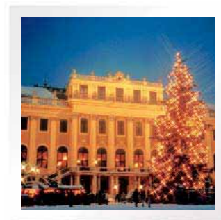
Schönbrunn Palace, Vienna