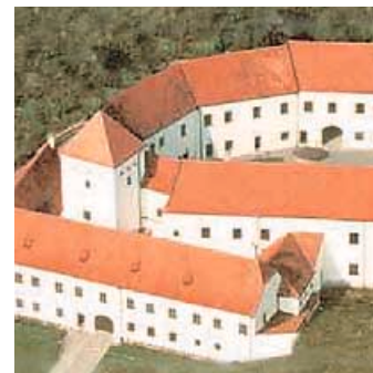
ČEJKOVICE CHATEAU First Class

Located in one of the most well known winemaking regions of South Moravia, near Hodonín. The hotel is situated within a newly rebuilt 13th century Gothic fortress formerly belonging to the Order of Templar Knights. 22 rooms and 2 suites, all with shower/WC, direct-dial telephone, SAT-TV. Restaurant, lounge, conference rooms (100, 30 people), wine cellar with up to 120 seats. The chateau wine gallery offers wine tasting and a wide assortment of local wines for sale. Parking lot.