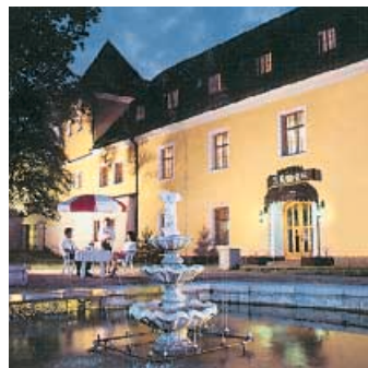
VELKÁ BYSTRICE CHATEAU Standard Class

This completely reconstructed hotel, former residence of the Thurn-Taxis family, is situated in Central Bohemia, approx. 55 km from Prague. Beautiful woods that invite relaxation and walks surround the hotel. 29 rooms with 68 beds. Standard or superior rooms (double rooms and suites decorated in Art Nouveau style) with shower/WC, SAT-TV, telephone. Restaurant, lobby bar, summer terrace. Volleyball playground and tennis courts nearby.