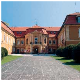
ŠTÍŘÍN CASTLE and DEPENDANCE, Štířín First Class

Located just 40 minutes' drive from the historical centre of Prague, on motorway D1, Exit 15 - Velké Popovice-Štířín. The Baroque castle was refurbished during 1985-1994 and became the first Czech hotel to be admitted as a member of the Association of European Castle Hotels and Restaurants. 26 rooms with bath or shower/WC, colour TV, telephone, cocktail mini-bar. Restaurant, night bar, summer terrace, Café. Historical meeting rooms with stylish furniture. Salmův Hall for up to 250 people.