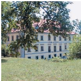
HOTEL MAXMILIAN, Loučeň Standard Class

Located in the neighbourhood of the Hluboká nad Vltavou Castle in South Bohemia. The newly reconstructed part of the chateau originally served as the servants' quarters for staff from the Hluboká Castle. A beautiful hotel complex comprising 44 rooms of various types (chateau rooms, king's rooms and suites). All rooms with bath/WC, stylish chateau furniture, minibar, telephone, safe, SAT-TV, radio. Chateau restaurant, Lobby bar, summer terrace and leisure centre with indoor swimming pool, whirlpool, sauna, gym, solarium, body massage and Thai massage. Parking in the hotel garage.