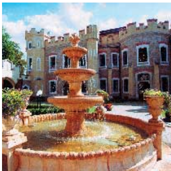
ŠTEKL CHATEAU, Hluboká First Class

The leading hotel in Český Krumlov - a member of the Association of European Castle Hotels. It was built in the 16th century. The recent extensive interior restoration and modernisation have revealed the stunning beauty of the Renaissance building style. Located in the historic city centre, 71 rooms and suites with bath/shower/WC, SAT-TV, direct-dial telephone, minibar, hairdryer. Restaurant, dining hall, lobby bar, Internet Café, Jesuit hall (150 seats), panoramic summer terrace, fitness centre with swimming pool, sauna, massage, solarium and beauty parlour. Parking in front of the hotel.