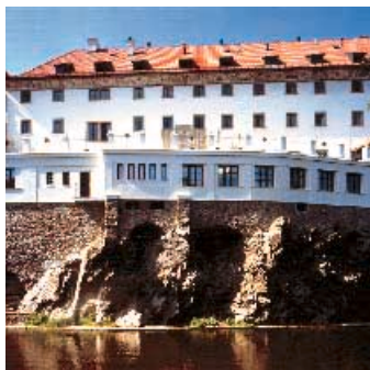
RŮŽE HOTEL, Český Krumlov Deluxe Class

Dependance of Štířín Castle is a newly reconstructed building in the former farming court near the castle. 14 rooms equipped in rustic Baroque style. Rondel is located at the new building near the castle featuring original and organic architecture. 3 double rooms with stylish bathrooms, restaurant with a bar, indoor golf driving range and putting green. 9-hole golf course in the castle parklands, tennis court, fitness centre and petanque.