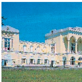
HRANIČNÍ ZÁMEČEK (Border Chateau), Hlohovec First Class

This renovated Chateau hotel is situated in a quiet place in the centre of Velká Bystrice, near Svatý Kopeček (Holy Hill), 5 km from Olomouc. 12 rooms with bath/WC, 2 rooms with shower/WC and 4 rooms with shared private facilities, SAT-TV, radio, minibar. Restaurant, day bar, meeting rooms. Fitness centre (indoor swimming pool in nearby Olomouc). Parking.