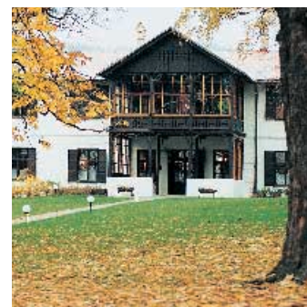
TUSKULUM Villa near Zlín Standard Class

Located in one of the most well known winemaking regions of South Moravia, near Hodonín. The hotel is situated within a newly rebuilt 13th century Gothic fortress formerly belonging to the Order of Templar Knights. 22 rooms and 2 suites, all with shower/WC, direct-dial telephone, SAT-TV. Restaurant, lounge, conference rooms (100, 30 people), wine cellar with up to 120 seats. The chateau wine gallery offers wine tasting and a wide assortment of local wines for sale. Parking lot.