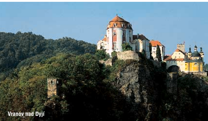
Vranov nad Dyjí