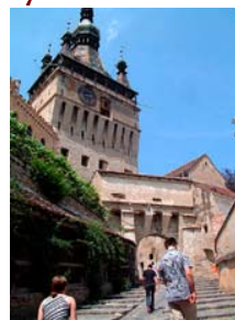
Sighisoara - the Clock Tower