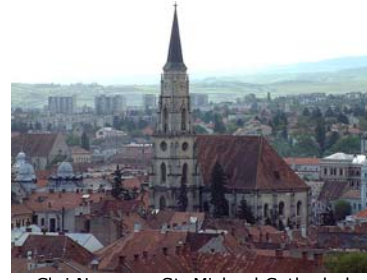
Cluj Napoca - St. Michael Cathedral