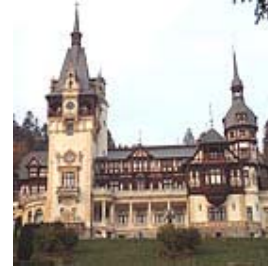
Sinaia - Peles Castle