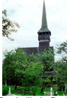
Rozavlea Wooden Church