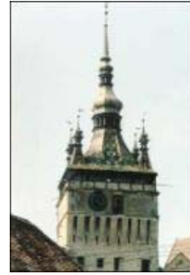
Sighisoara - the Clock Tower